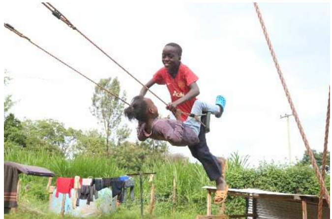
Above-Fun on the swing.