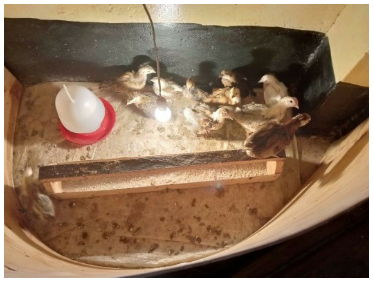
They have managed to hatch more chicks.

The chicken project is also doing quite well but because of the way they look after them (in a house off the ground) it does cost rather a lot to feed them. We do try to encourage using scraps to give them but that is not done as regularly as we would like really. We are monitoring the progress and when we go out there we can update you more and even see if there can be improvements to help make it more successful.